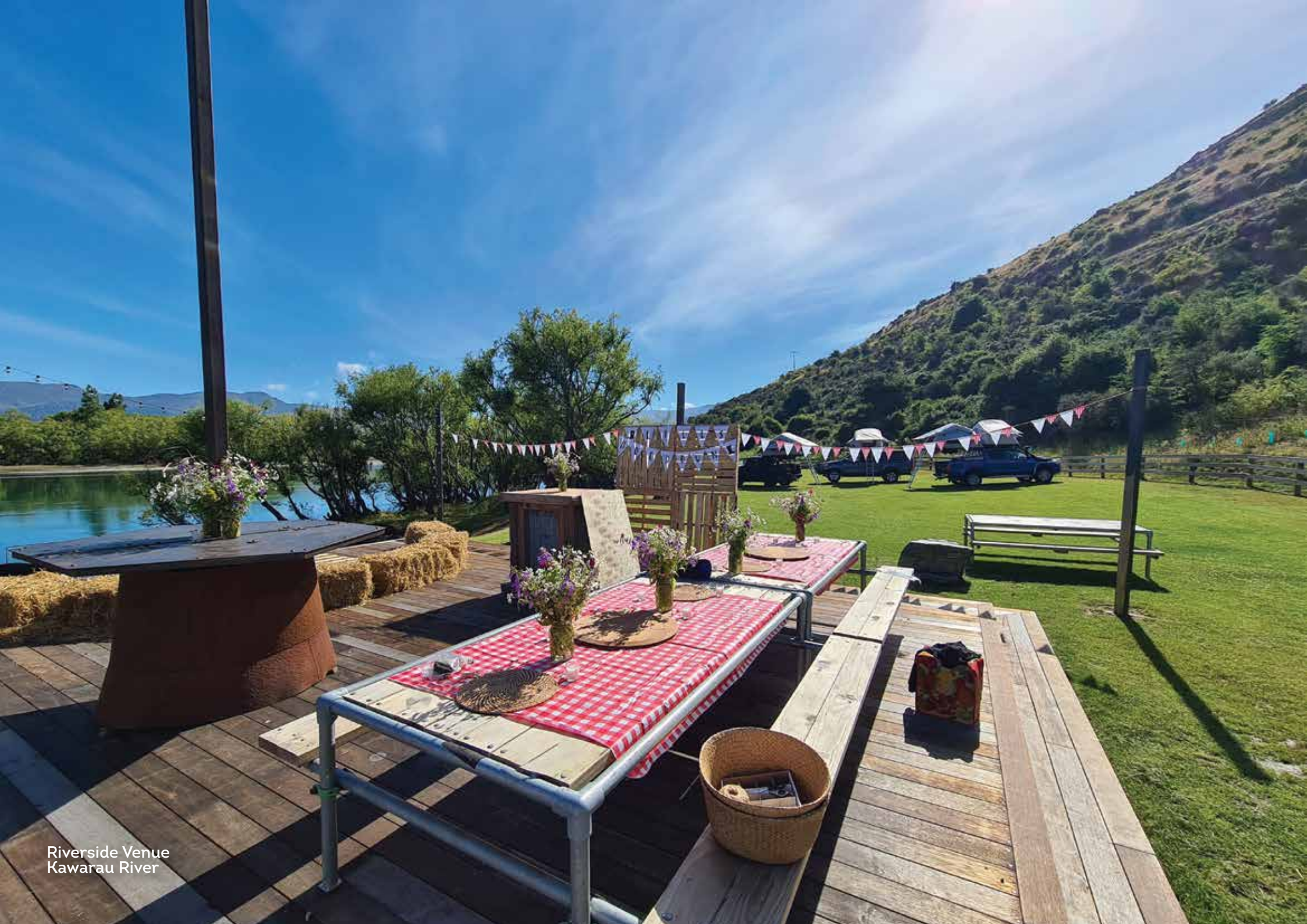
Riverside Venue Kawarau River