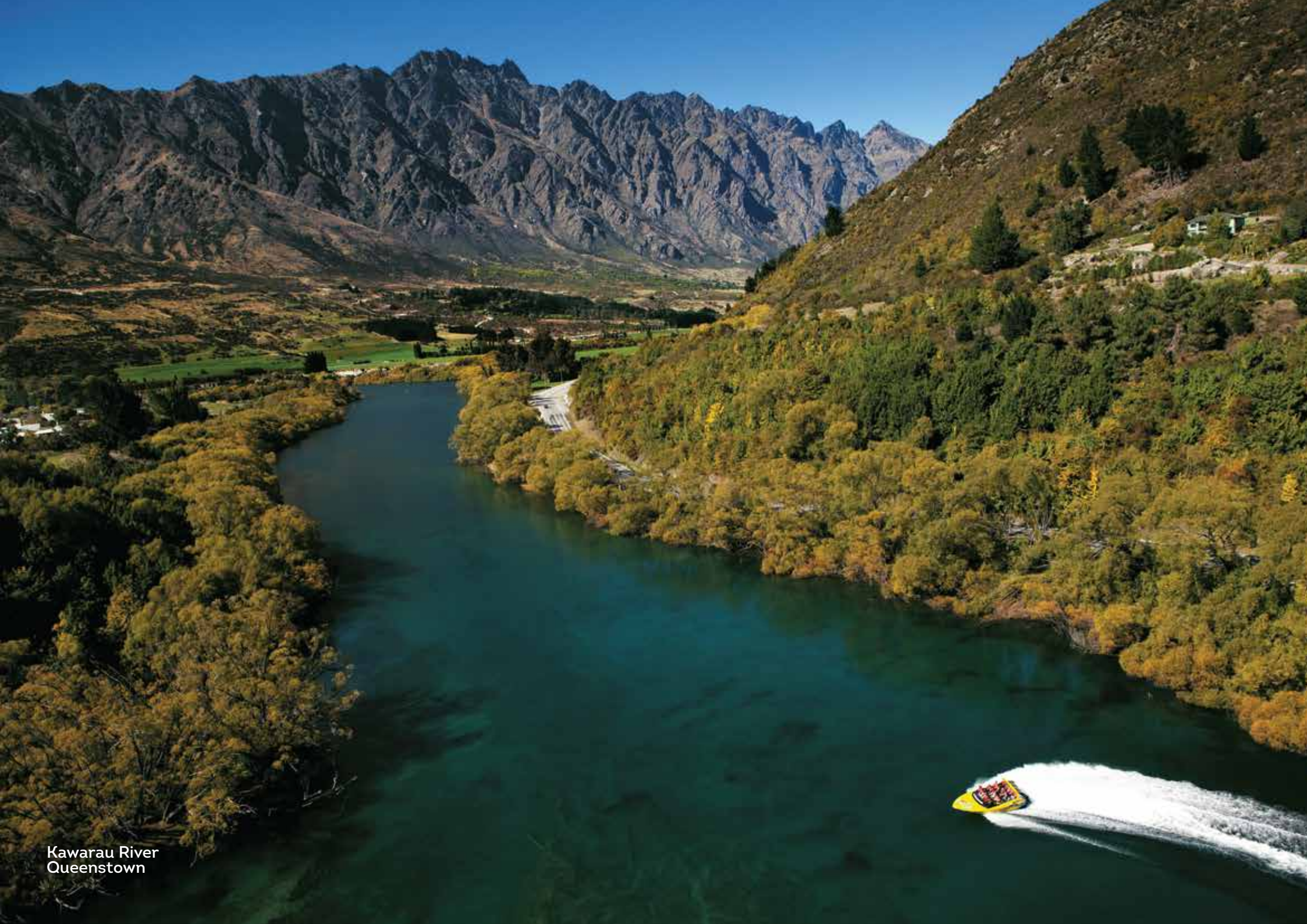
Kawarau River Queenstown